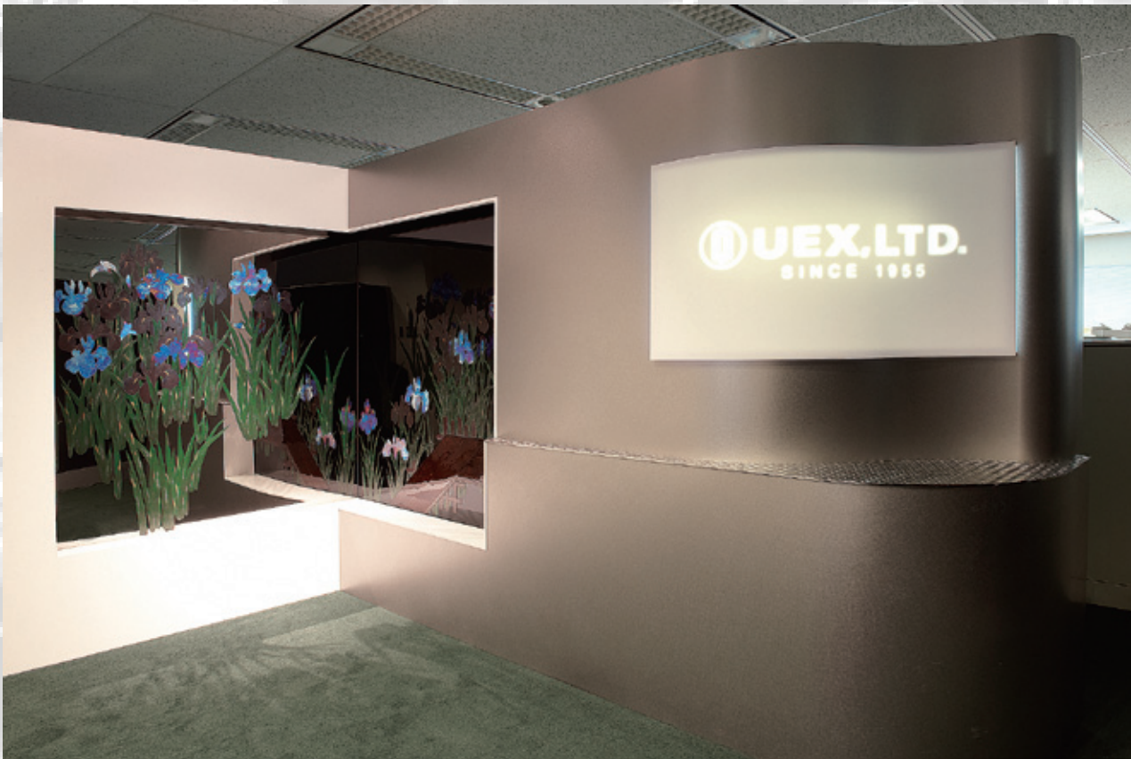
After installation The reception area in UEX, Ltd. Titan Maki-e "Iris Flowers"

Urushi - One of the most durable natural lacquers favored in Japan for almost 9000 years. Excellent as coating, and most often used on wooden base, from household necessities to precious properties.